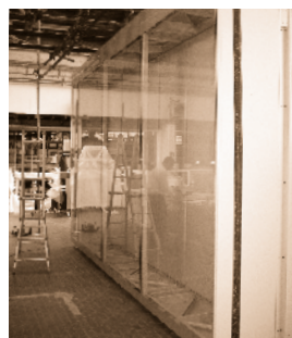
New MOA cases in Milan.

Phase I of MOA's Renewal Project is well underway, with construction largely complete on our new research wing. In Phase II, we undertake renovation of our existing spaces, including the former Visible Storage Galleries, which will be completely reimagined and reconstituted as the Multiversity Galleries, and officially launched – along with the new wing – in January 2010. To manufacture new cases for this gallery, MOA has contracted Goppion Laboratorio, an internationally renowned Italian firm whose work includes case construction for The Mona Lisa in the Louvre, the Crown Jewels in the Tower of London, and the Dead Sea Scrolls in Jerusalem.