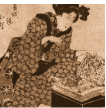
Detail: Print by Gyokuran Sadahide (1807-73).