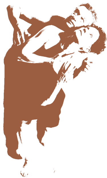
Kokoro Dance.