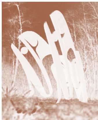
yaahl kingnganggang by Robert Davidson, 2004.

The Museum has embarked upon a major Renewal Project known as A Partnership of Peoples (for details, see www.moa.ubc.ca/renewal ). In this exhibit, MOA displays its plans for expansion and renovation, a scale model, and samples of architectural details, finishings, and furnishings. We also open a window onto our Digitization Studio, in which a team of professional photographers use state-of-the-art digital cameras and high-speed computers to capture high resolution images of the collections throughout the day.