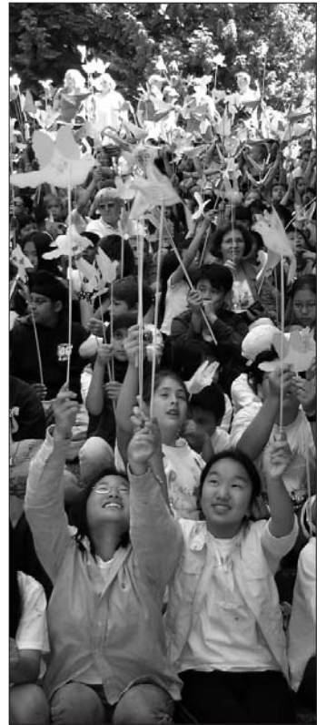
Schoolchildren with peace doves.

The exhibit Acts of Transformation presents artworks by students from Vancouver and the Maska District in Uganda. Some depict toys of violence transformed into messages of peace, others are 2-d representations of reconciliation in the face of war. In conjunction with the exhibit, MOA is offering educational workshops which include a tour of the exhibition and an interactive workshop transforming toys of violence into works of art. For details, contact Karen Benbassat kbenbass@interchange.ubc.ca or 604.822.5978. Cost: $7.00 per student (includes art supplies but not toys).