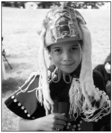
Gitksan Dancer.