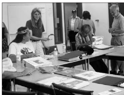
MOA curators in Port Alberni.